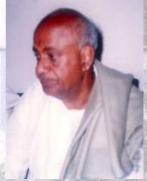
Mr. H D Deve Gowda Patron of WPEDO Former Prime Minister of India

Project management: The Founder Chairman / President plays most vital role in the planning of the development program. He is directly responsible for the overall management and implementation of all the development projects undertaken by the Organization. For the smooth operation, implementation and management of the program activities other members of the Executive Committee assist in the planning and management of the projects undertaken by the Organization.