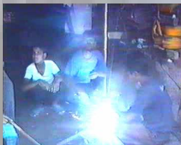
Very risky work by child labour