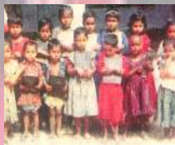
Satellite based free primary school for the poor and homeless children