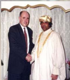
Sher-E-Khwaja with Russian Deputy Foreign Minister G B Karasin at WPEDO Head Office.