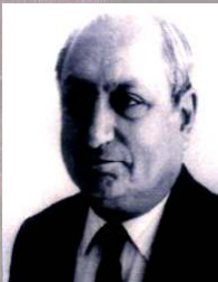
Mr. Romesh Bhandari Secretary General of WPEDO Ex. Foreign Secretary and Governors of India

In order to share expert view and suggestion for the on going development activities the Executive Committee can appoint advisors from the General Committee Members. WPEDO has 7 members Advisory Committee internationally. They use to play key role in project planning by sharing their expertise in related field. The Executive Committee appoints this committee. Their responsibility is to advise the Executive Committee and the General Committee in special situation to make their recommendation to dissolve critical problems in the operational process of the Organization.