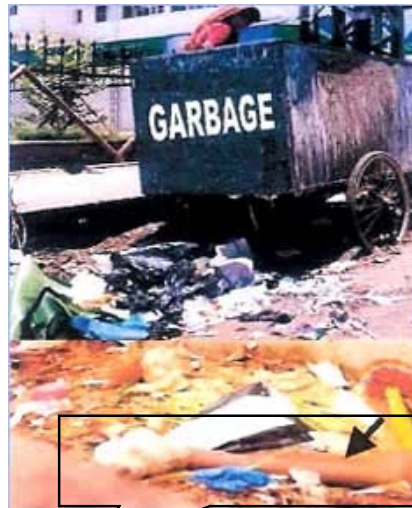
Women are looking for something in the garbage to survive where a part of human body (leg) found.

6. Women's Rights: To ensure the establishment of women's rights as legitimate Human Rights by modifying the discriminating attitude prevailing in the male dominated society and eliminating the negative factors which working in the society against women empowerment and equality.