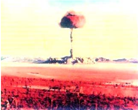
STOP PRODUCING AND TESTING NUCLEAR WEAPONS

3. International Anti Nuclear Weapons: Save the mankind from vicious Nuclear Armament, Nuclear Weapons and Ammunition and its devastating effect for the human society.