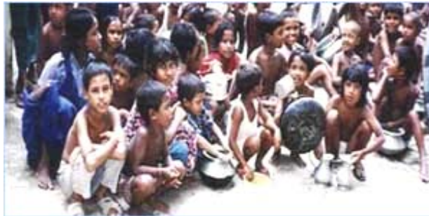
Poor homeless children waiting for relief