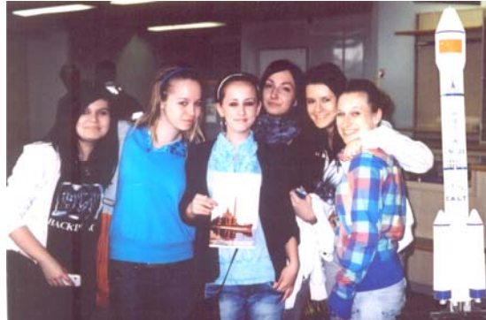
GIRLS ARE DEMONSTRATING AGAINST ANTI NUCLEAR WEAPONS IN THE UNITED NATIONS VIENNA INTERNATIONAL CONVENTION CENTRE (IN FRONT OF THE RECEPTION), AUSTRIA ON 28TH APRIL 2011 IN FAVOUR OF WPEDO

4. Anti Civil War: Save the nations of the world from the curse of Civil War, those who are involved in Civil War, which bring destruction and create the obstacle to national progress and prosperity.