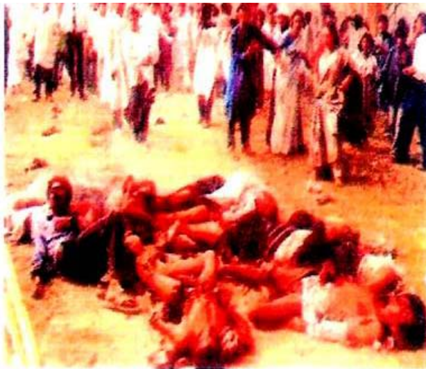
STOP KILLING THE HUMAN

4. Anti Civil War: Save the nations of the world from the curse of Civil War, those who are involved in Civil War, which bring destruction and create the obstacle to national progress and prosperity.