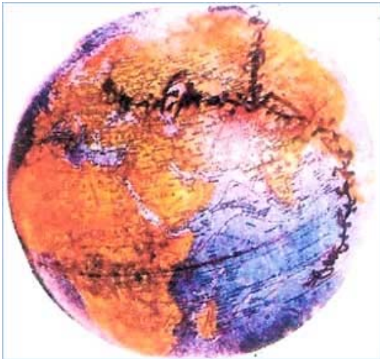
Save the Green House

5. Environment: To ensure the protection of environment through a series of pragmatic environmental program in order to save the environment of the world from further degradation and negative impact of green house effect.