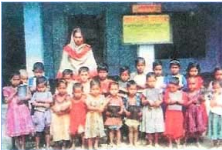
Satellite education for children with teacher's