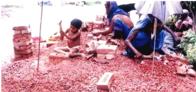
POOR HOMELESS CHILDREN AND WOMEN WORKERS

6. Women's Rights: To ensure the establishment of women's rights as legitimate Human Rights by modifying the discriminating attitude prevailing in the male dominated society and eliminating the negative factors which working in the society against women empowerment and equality.