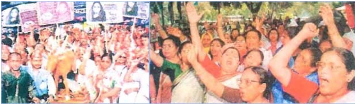
THEY ARE PROTESTING FOR WOMEN'S RIGHTS

Women's Rights (since 1981): Awareness raising and motivation session were carried out regarding women's rights. In this session the organization peruse the establishment of women for human rights. In the male dominated society women were encouraged to come forward in all activities to prove their ability, side by the male counter part were motivate to give a fare chance to them. Vulnerable poor women who became the victim of social injustice like dowry, separation, physically assaulted by husband, rape and sexual harassment were provided with free counseling and legal aid. Illiteracy stands as a major barrier toward awareness, which is a key factor in achieving women right. Adult literacy program has been undertaken for these poor women to free them from illiteracy and enhance their awareness level.