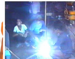
Very risky work by child labour

Assistance to children and mother: From the very beginning of the organization we are providing assistance in terms of food, clothing, education materials etc for the children living in orphanages in different poor countries. Similar kind of assistance is also being provided for the street children, the children who are involved in worst form child labor in risky jobs. We formed a banner: Save the children WPEDO: